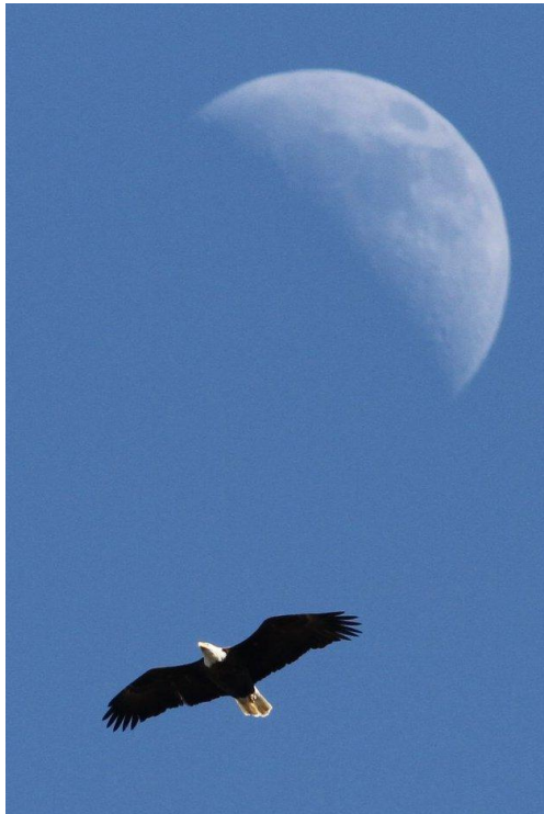
taken at the Mackinaw City Hawk Watch on March 29 th 2012